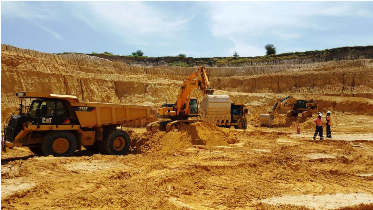
Figure 1: Ongoing phosphate mining activities