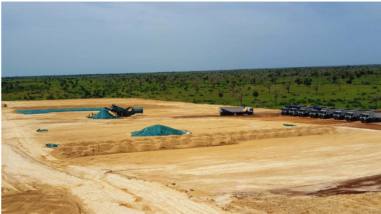
Figure 2: Product drying area from processing plant