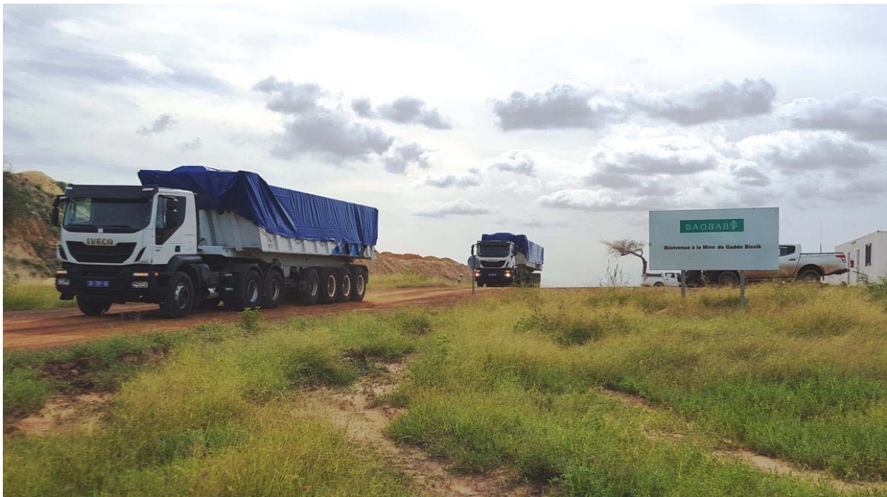
Figure 4: Loaded 50T covered trucks departing for Port of Dakar